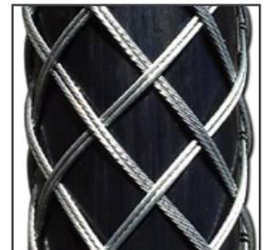
(2-layered / enhanced)

RP-700-H: Available in standard lengths 200 mm to 500 mm. Other lengths upon request! Also available in the following design: