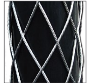
(1-layered / standard)